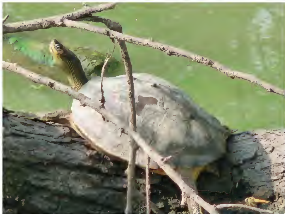
Fig. 2E. Indian Roofed Turtle Pangshura tectum .